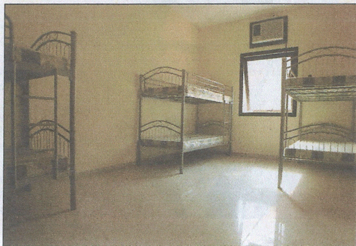
TRACY BRAND/Gulf News

"When you give better conditions, you expect better productivity."